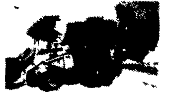
1986 580 Super E Tractor, Loader, Backhoe With Extendahoe With Cab & Air, Nice $18,000