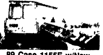
89 Case 1155E w/New Sprocket & Roller & Pins & Bushings, In Excellent Condition $32,500