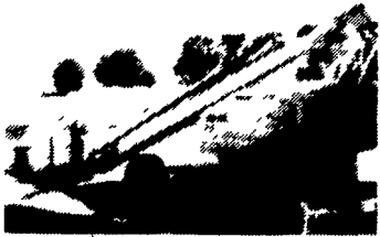
JLG 60G With Ford Engine & Rotating Basket & Extendable Axles $17,500