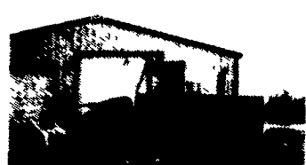
1987 Kawasaki 3800 Hr. In Excellent Condition $49,900