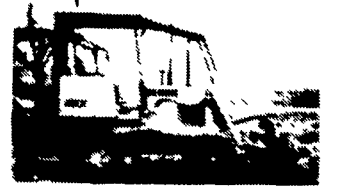
1986 Case 450C Crawler, w/6 way Blade, 1280 Hr., U/C Excellent $19,500