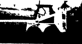
843 Bobcat Diesel, GP Bucket, Nice Condition $11,500