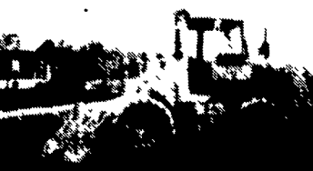
JD 544 B, Nice w/Fair Rubber $19,500