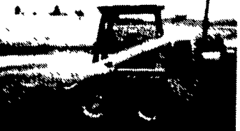
Mustang 342 Diesel, GP Bucket $8,500