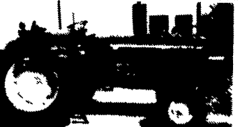
JD 3130, New Rubber On Front, New 18" Rubber On Rear, Nice Condition

We Buy & Sell Financing Or Lease Purchase Available