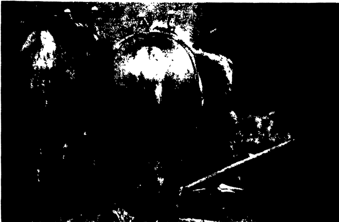
The Plowfest shows old-time plowing by horses, mules, oxen, and ponies. Participants will plow down the field, drag it, disk it, and plant. Visitors can watch the entire process.

The museum's historical farming program is adding two new major features. On Saturday a Plowfest will be taking place most of the day. Visitors will see skilled horse teams plowing a field. On Sunday the Red Rose Carriage Club will perform precision movements (dressage), displaying a variety of horses and carriages. To raise funds for the museum's farming program, volunteers will be running Cow Chip Bingo at the Log Farm.