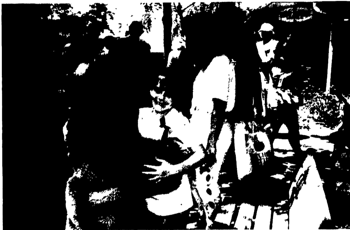
Yummie the Gingerbread Person gives a guest a welcoming hug.

The pie throwing the the pie sales were not just for fun — although it was — but to raise money for the Muscular Dystrophy Association. This year $614 was raised for the Association.