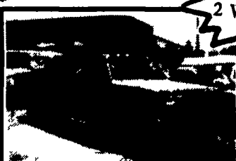
'88 FORD EX-CAB 4x4, HD 1/2 Ton, Loaded, Trailer Tow Pkg.