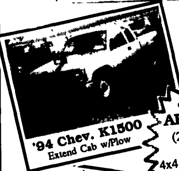
'94 Chev. K1500 Extend Cab w/Plow

JUST ARRIVED (2) '94 Z71 K1500 4x4, Extend Cabs