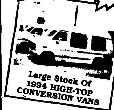
Large Stock of 1994 HIGH-TOP CONVERSION VANS