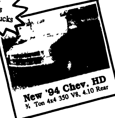
New '94 Chev. HD 1/2 Ton 4x4 350 V8, 4.10 Rear