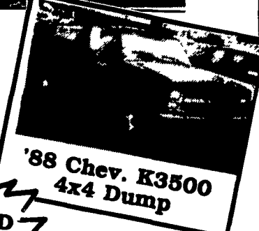
'88 Chev. K3500 4x4 Dump

JUST ARRIVED (3) '94 4x4 Work Trucks 2 WD Work Trucks IN STOCK