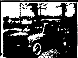
'91 GMC 3500 FLATBED V8, 4 Spd.

JUST ARRIVED (2) '94 Z71 K1500 4x4, Extend Cabs