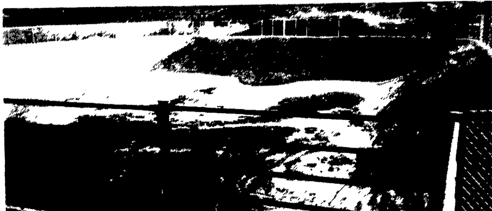
SCS Approved Manure Storage Facility

Specializing In Manure Storage Round or Rectangular In Ground or Above Ground