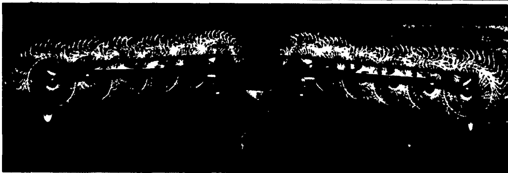
The H&S 12 WHEEL HYDRAULIC OPENING IS PICTURED.

FOUR MODELS TO CHOOSE FROM— A SIZE FOR EVERY OPERATION