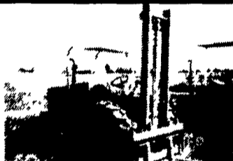
1970 AC 1500 Forklift, Gas, 21', Side Shift, New Paint. $9,500