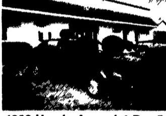
1988 Honda Accord 4 Dr., 5 Spd., Air, AM-FM Cass., 81K Miles, Runs Good, Blue. $5,450