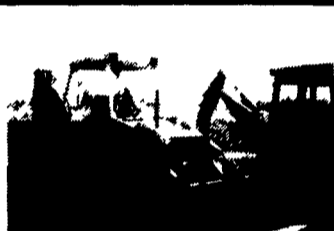
1985 JCB 1550 Extendahoe, ROPS, Runs Good. $13,500