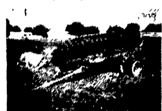
Miller 14' Offset Disc, Good Condition. $3,900

WANTED: Good Late Model Construction Equipment Need S/N And Price When You Call