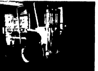
IH 340 Forklift- Gas- Runs Good. $5,900