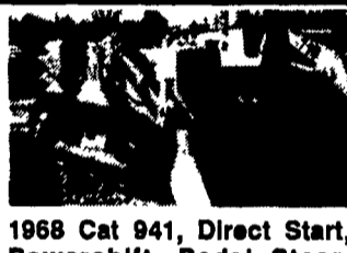
1968 Cat 941, Direct Start, Powershift, Pedal Steer, Runs Good. $11,500