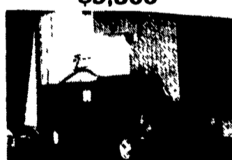
1977 Ford F350 Bucket Truck, Approx. 28' Reach. $2,900