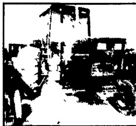
IH 5088 Tractor 135 HP, 1984