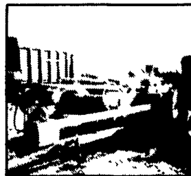
JD 3960 Harvester With 7 Ft. Hay Head $7,500