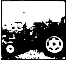
Zetor 50 HP, 1985 1200 Hours $6,500