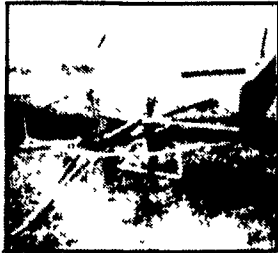
Deutz Fahr PTO Gyro Rake 2 In Stock 1-$1,850 1-$2,250