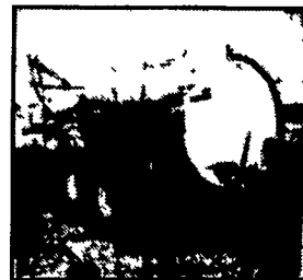
John Blue 1200 Gal. w/45 ft. Hyd. Fold Boom Chemical Inductor, Foam Marker and Clean Water Dispenser. 5 Years Old - Very Good Condition