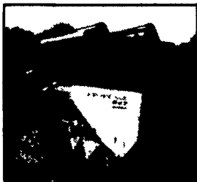
NH 847 Round Baler Auto-Wrap - Good Condition $5,200

Track Down BIG BUYS ON QUALITY Used Equipment