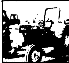
Ford 4610 52 HP 1200 Hrs. $14,900