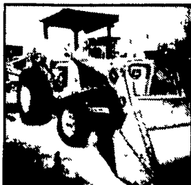
JD 301A 50 HP w/Loader, 900 Hrs. $12,900