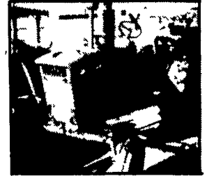
JD 3020 Gas $5,500