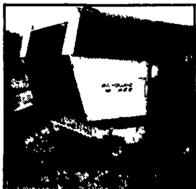
NH 853 Round Baler Used 2 Seasons $9,900