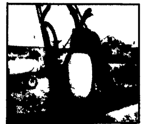
Hardi-Air Blast Boom Sprayer 155 Gal. 26' Boom, Excellent Condition $3,500