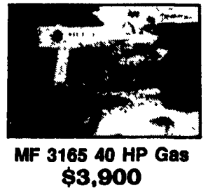
MF 3165 40 HP Gas $3,900