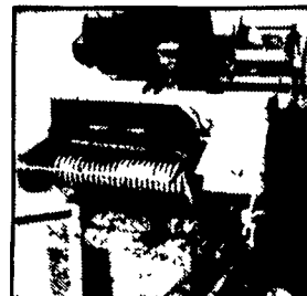
JD 347 Baler w/30 Bale Ejector $5,900