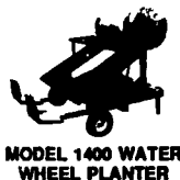
MODEL 1400 WATER WHEEL PLANTER

MOST ITEMS IN STOCK FOR IMMEDIATE DELIVERY DISCOUNTS ON QUANTITY ORDERS WE SHIP UPS DAILY LARGER ORDERS SHIPPED MOTOR FREIGHT