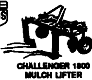
CHALLENGER 1800 MULCH LIFTER

DISCOUNTED PRICES ON PHOTO DEGRADEABLE PLASTIC