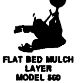
FLAT BED MULCH LAYER MODEL 500

FREE 1994 CATALOG EQUIPMENT MFG. BY RAIN-FLO IRR.