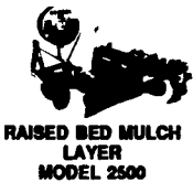
RAISED BED MULCH LAYER MODEL 2500

DISCOUNTED PRICES ON PHOTO DEGRADEABLE PLASTIC