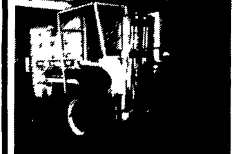
IH 340 Forklift- Gas- Runs Good. $5,900