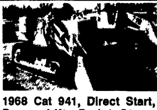
1968 Cat 941, Direct Start, Powershift, Pedal Steer, Runs Good. $11,500