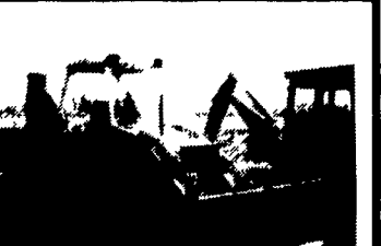
1985 JCB 1550 Extendahoe, ROPS, Runs Good. $13,500