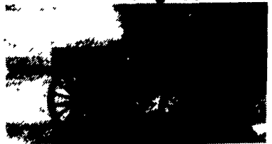
Pony Size Farm Wagon