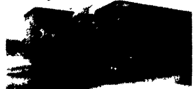
Ford Tractor 9000 Cabover, Kentucky Horse Van Trailer, Also 1986 Delta 15' 4-Horse Trailer. All Interested Buyers For These Units, Please Call Auction Site To Be Certain They Have Arrived.