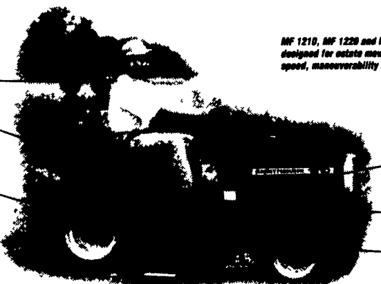
MF 1210, MF 1220 and MF 1230 tractors are low profile, designed for estate mowing and lighter chores where speed, maneuverability and comfort are important.

Manufacturer estimated net engine horsepower