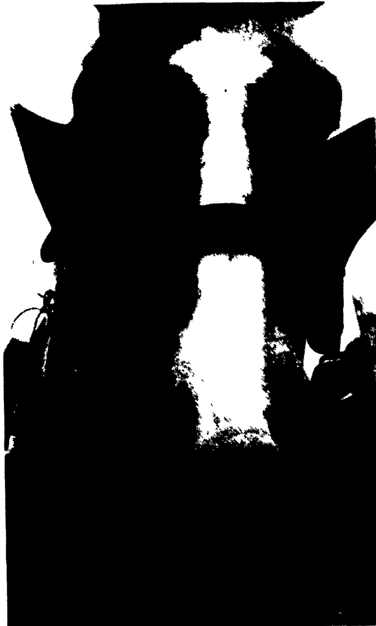
Stop horsing around with that camera.