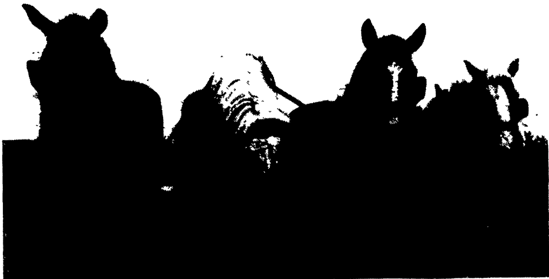
Heads up. Please.