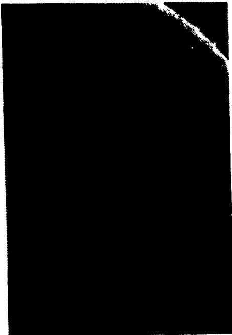
Clods on steel.