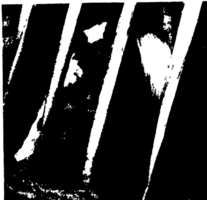
Get your camera out of my private bedroom!