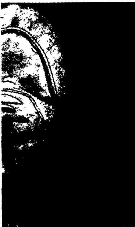
We brake for low flying geese.