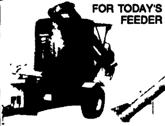
ROLLER MIXER & HAMMERMILL