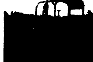
1979 IH TD8E Dozer, 6 Way, ROPS, Newly Rebuilt Engine, Very Good U/C. $19,500