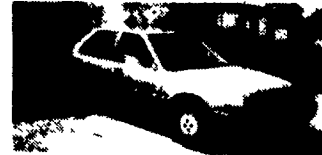
1988 Honda Accord 4 Dr., 5 Spd., Air, AM-FM Cass., 81K Miles, Runs Good, Blue. $5,450