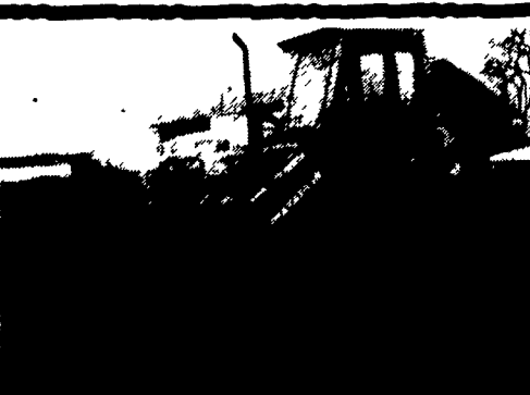
Flat Allis FL10C Crawler Loader $21,500

Vernon E. Stup Co. 5859 Urbana Pike Frederick, Md. 21701 301-663-3185