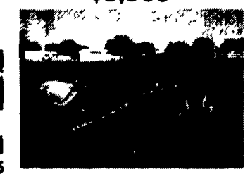
Miller 14' Offset Disc, Good Condition. $3,900

WANTED: Good Late Model Construction Equipment Need S/N And Price When You Call