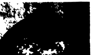
Art Glass Lamp