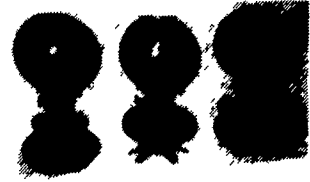
3 of Many 12" Lamps