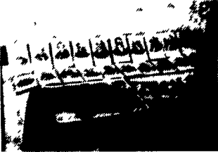
Collection of Paper Memorabilia