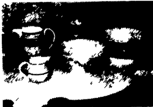
Mocha Including Earthworm Pattern