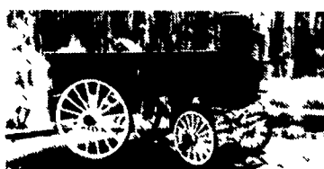
Hitch Wagon (One Of Three Hitch Wagons)