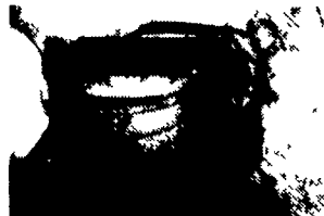
Old Wooden Tub Washer

Pair Of Ponies, Harness & Restored Delivery Wagon (Will Be Sold As One Unit).