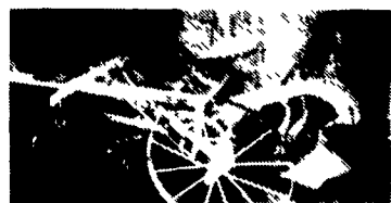
John Deere 3-Horse Hitch, 2 Way Plow, All Original