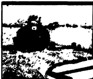
Kuhn introduces the best disc mower in the world.