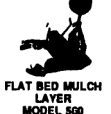
FLAT BED MULCH LAYER MODEL 500

DISCOUNTED PRICES ON PHOTO DEGRADEABLE PLASTIC