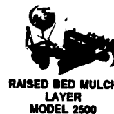
RAISED BED MULCH LAYER MODEL 2500