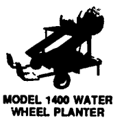
MODEL 1400 WATER WHEEL PLANTER