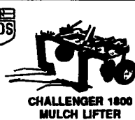
CHALLENGER 1800 MULCH LIFTER