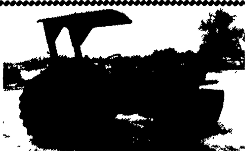
Ford 4610 Series II, 3200 Hrs., 1988, Runs Good $7,800