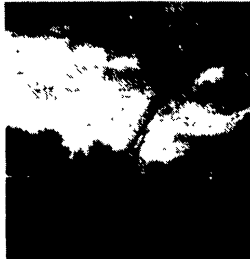
Bucket Trucks 28' to 65' Gas and Diesel. Call For Details.