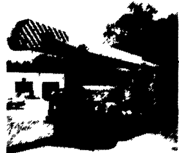
Holan 70' Double Bucket 75' working height mounted on 1981 Western Standard, 6x6 Flatbed, CAT 3208, Auto.