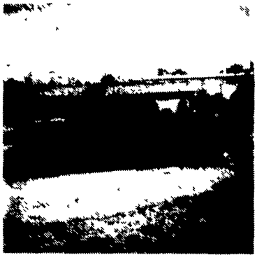
One Of Two 1987 Ford F-350, 460 Eng, 4 Spd., Great For Pulling Trailers

Huntingdon Valley, PA • 215-672-9667 • 1-800-543-3833 • Eddie