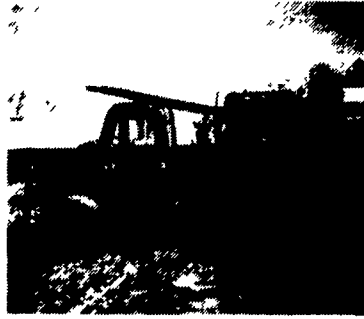
International Presser Digger This Unit Is Ready To Work, Priced For Quick Sale $9,500 $8,500