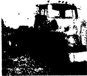
1970 Ford 800 V8 5 Speed with Aux. Trans, 39,000 GVW, VAC Brakes 13'4" Fran Fleet Maintained, 73,000 Miles.