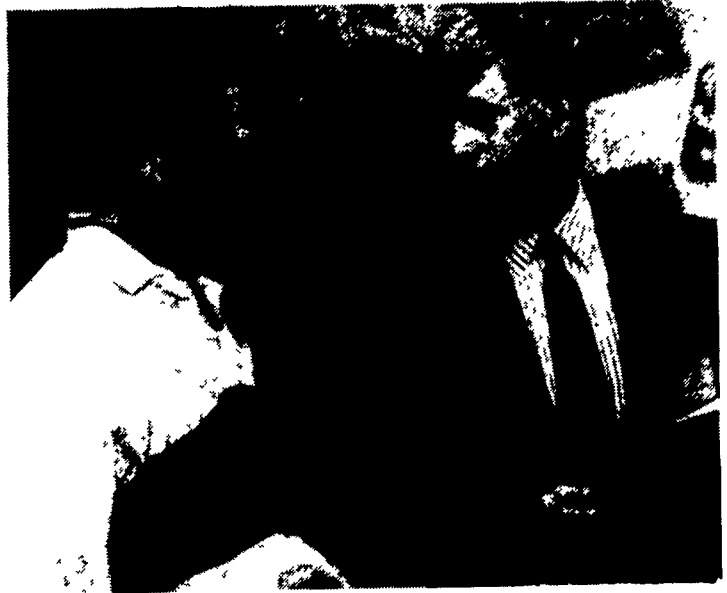
A poultry-processing company representative talks with a student about job opportunities during the University of Delaware College of Agricultural Sciences career fair last month.

This year's fair attracted nine new companies. Most of the businesses are from Delaware, where agricultural industries seem to be