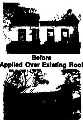
Before Applied Over Existing Roof

PO Box 231 Rehrersburg, PA 19550 (717) 933-4666 (717) FAX 933-5305