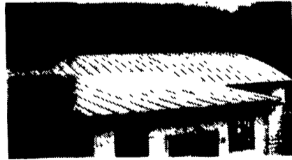
Good For All Roof Angles