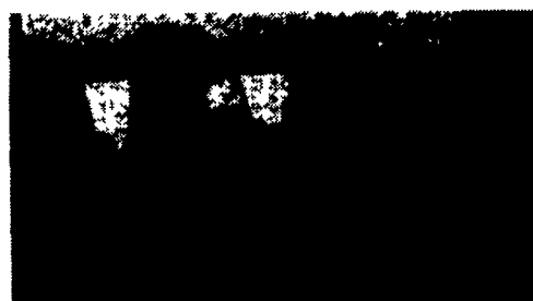
DYNAHOE D190 Wheel Loader Back- hoe $9,900