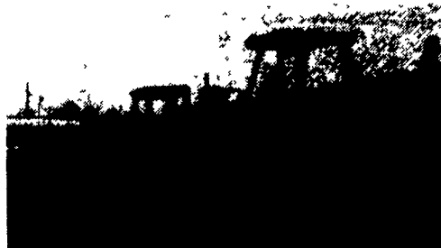
FIAT ALLIS FL10C Crawler Loader $18,000