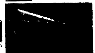
N-TECH MANURE PUMPS