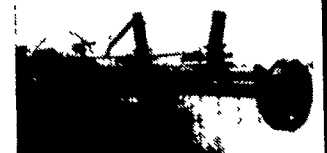
Two-point Nesseth Shredder Pump w/Standard Bottom Port and Optional Top Port Agitator