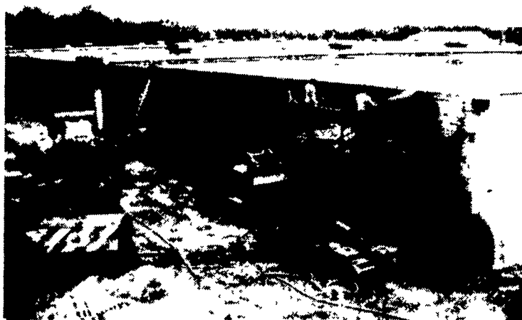
Block Wall Being Restored With Gunite

LET MAR-ALLEN CONCRETE "The Concrete Specialists" SOLVE YOUR PROBLEM As Shown in Picture