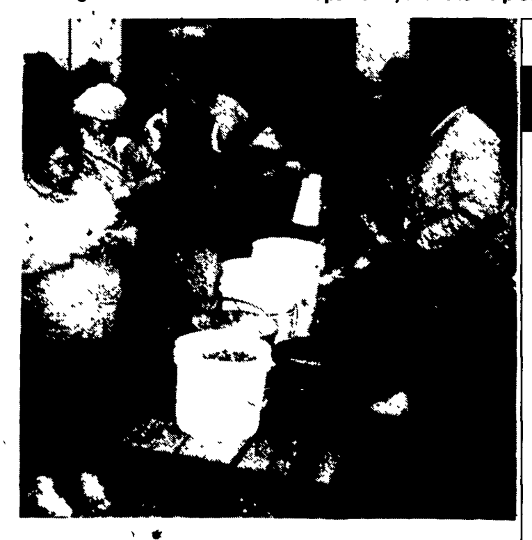
The Beef Council supplied handouts for teachers during the tour Tuesday evening.