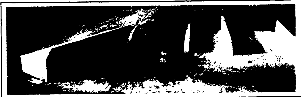
Commodity Bins And Trench Silos