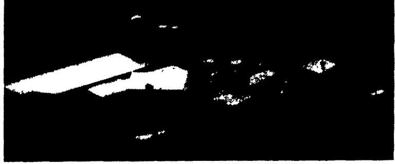
SALE/LEASE with Option to Purchase:

164 A+ Modern dairy farm. 445 free stall, double-eight Herringbone parlor complete with 16 Boumatic auto take off units and 5,000 gal. tank; (2) Harvestore silos; (1) Madison silo; (1) 8'x40'x200' and (2) 8'x40'x180' concrete above-ground trench silos; concrete liquid manure storage; 24'x80' covered holding area with crowd gate. 30'x40' sick bay; 50'x90' Morton shop building; 40'x80' bank barn. Remodeled 2 story, 3 bath dwelling; 12'x55' mobile home. 3 drilled wells. Productive, level Duffield loam soils, 90% tillable. For price & terms, contact James G. Trout, Broker, Trout Real Estate, Inc. 301-694-0222, or at home 301-698-9391