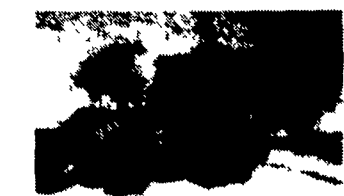
1986 580 Super E Tractor, Loader, Backhoe With Extendahoe With Cab & Air, Nice $18,000