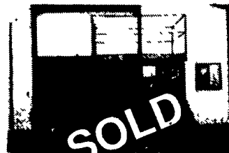
18' Platform Lift $2,800

1973 Chevy tandem axle dump truck, PS, air brakes, 13' bed, good tires, 366 gas engine, 13 speed trans., good condition, $4500. 717-753-3391.