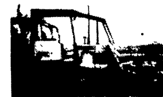
1986 Case 450C Crawler w/6 way Blade, 1280 Hr., U/C Excellent $23,000