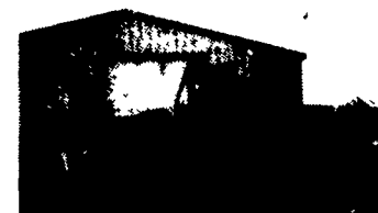
1987 Kawasaki 3800 Hr. In Excellent Condition $52,000

We Buy & Sell Financing Or Lease Purchase Available