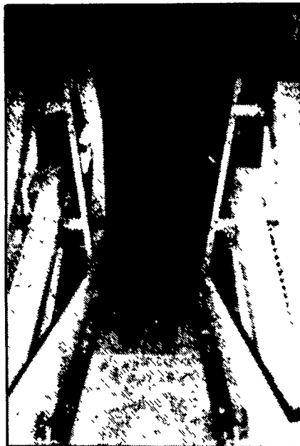
Chore-Time 45° bracket with 2x4 step rails protects cages and gives easy access to top tiers

★ Layer and pullet ★ contracts available.