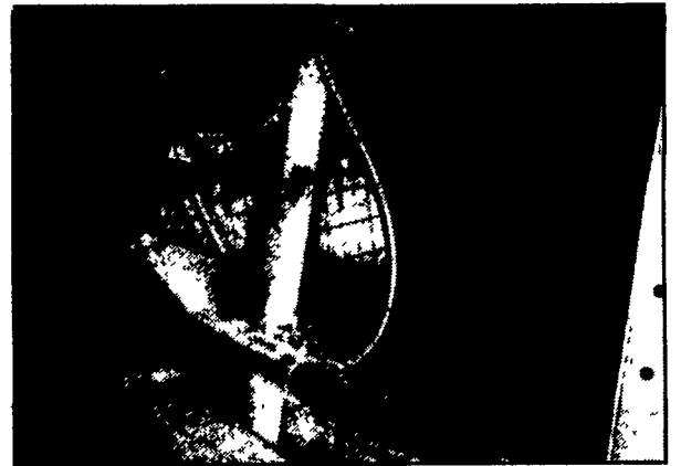
Chore-Time Durako cage 16" tall at front and 12" tall at back for maximum bird comfort (16"x20" 6 bird cages) ULTRAFLO nipple waterers on stands center of cage.

★ Call or write to learn why more Chore-time® cage systems with Chore-time® ULTRAFLO® feeding systems are being installed more often than all other systems combined. And learn how you can produce more eggs on less feed with less maintenance.