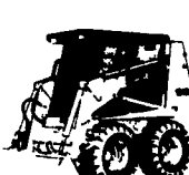
Model 1845C 60 hp diesel