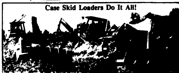
Case Skid Loaders Do It All!

In Stock 9 1/2 Foot Wide Transport Type, Tow Away A Quality Case IH Vibra Shank Today!