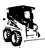
Model 1840 50 HP Diesel