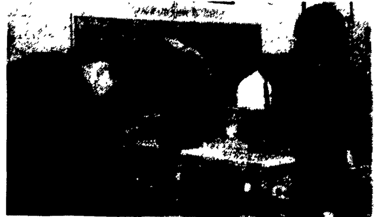
A group of students work on the wiring segment of the agriculture mechanics contest during the county FFA contests held at Solanco High School.