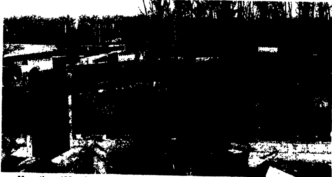
More than 100 volunteers turned out to help clean up the aftermath of a swiftly-moving fire that destroyed 45,000 chickens at the farm of Roy and Sara Diem in York County.

The Diems are undecided if they will rebuild.