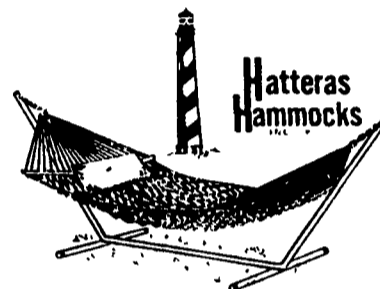
Hammock Prices From $27-$150