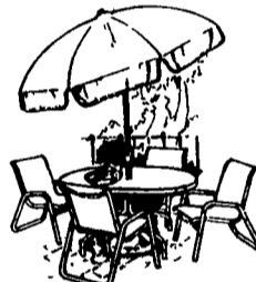
TELESCOPE PATIO FURNITURE