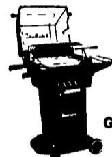
Grill Prices Start At $379