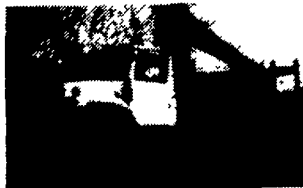
1981 IHC 1854 10' Dump With Knuckle Boom, Max 5 Ton, DT 468, 210 HP, 5 Spd., AB, 34,000 GVW, Owned & Maintained From New By A Major Utility Co.