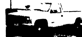
1988 CHEV 3500 Pickup Dual Rear Whl 6.2 Diesel, AT, PS, PB, Fleet Owned & Maintained From New. Ideal For Dump.