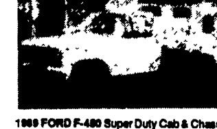
1989 FORD F-480 Super Duty Cab & Chassis Dual Rear Wheel, 7.3 Diesel, 5 Spd, Trans., AC, PS, PB, 50,000+ Miles, 14,600 G.V.W. Will Take A 8' Body, Excellent Condition, Fleet Maintained From New.

"COME TO ROYAL, WHERE EVERYONE IS TREATED LIKE A KING"