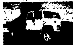
1984 IHC S1654 Crew Cab Dump, 6.9 Diesel, 5 Spd., 21,700 G.V.W. No CDL Required, Municipality Owned & Serviced From New, Excellent Condition.