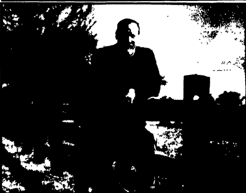
Slip Board, installed 1986