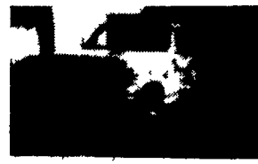
1989 FORD SUPER CAB, 460 Gas Engine, 5 Spd., 12 Ft. Stake Body, w/2 Tool Boxes #3116