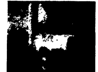
1989 FORD LTA 9000, 315 Cummins, 9 Spd., 12,000 Front Axle, 40,000 Rear Axle, Hi-Level Trim, Air Ride Suspension, AC, Full Air Faring. #3113.