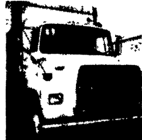
1989 FORD LN8000, FD-7.8 Liter, 5 Spd., Full Air Brakes, 26,000 GVW, PS, 18 Ft. Body.