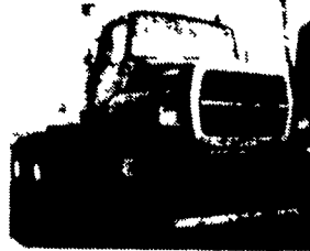
1988 FORD LNT 9000 NTC 315 Engine, 9 Spd., 12,000 Front Axle, 40,000 Rear Axle, PS, AC, New Paint, Low Miles.