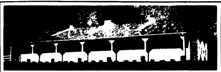
HORSE STALL BARN