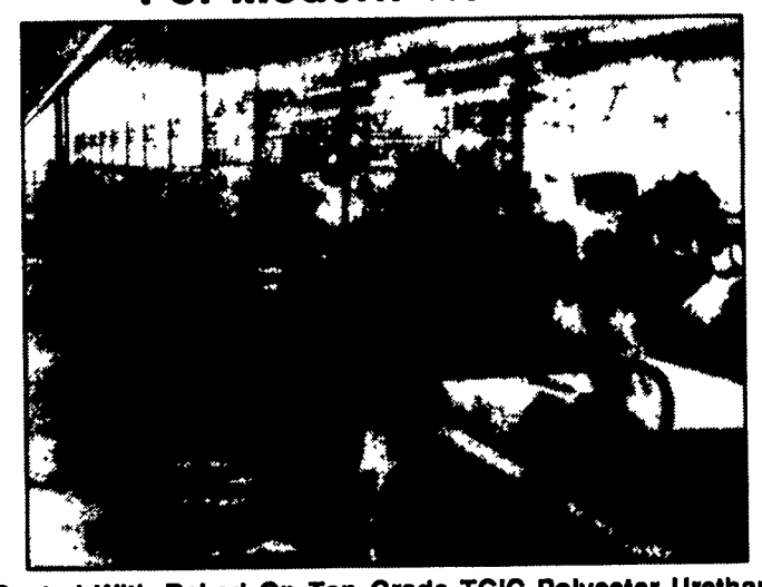
Coated With Baked On Top Grade TGIC Polyester Urethane Powder After Fabrication