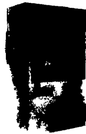
Farm Air Conditioner