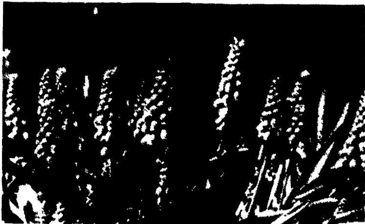
Hyacinths provide aroma, color, and style. Learn how to use them as companion plants in landscaping design.