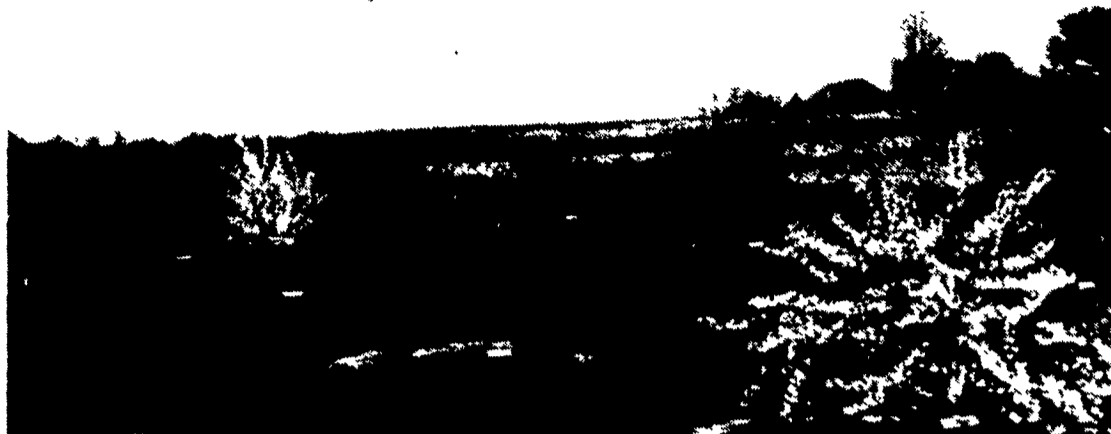
These crabapple trees at Penn State University's Landisville trial gardens are used for research in order to find ways to improve flowering and resistance to disease.

Internationally recognized landscape architect James Anthony van Sweden, who has created exquisite gardens throughout the world, is another speaker who will share his expertise.