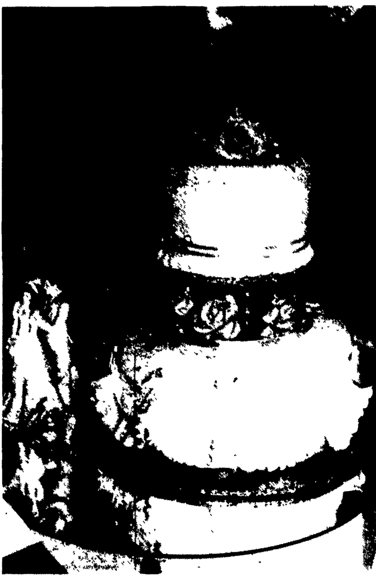
A wedding cake decorated in the European style of rolled fondant icing looks more like a priceless piece of porcelain than a tasty dessert. Decorated by Rosle Rohrer of Lancaster County, the cake was accented with lovely pink roses fashioned from gum paste, an edible modeling material.