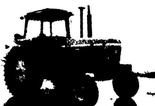
JD 4440 • 2500 Hrs. Excellent Condition

423 S. Colebrook Road • Manheim • Lancaster County • PA Rapho Twp. - 1 mile S. of Sporting Hill - 2 miles west of Manheim Auto Auction Route 283 to Manheim/Mt. Joy exit, Turn East on 772 • 3.5 miles, turn right (South) on Colebrook Road • See auction signs 8 tenths of a mile on left.