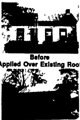
Applied Over Existing Roof