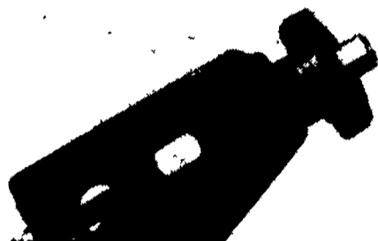
DIAL-A-DEPTH System Makes changing planting depth quick & easy