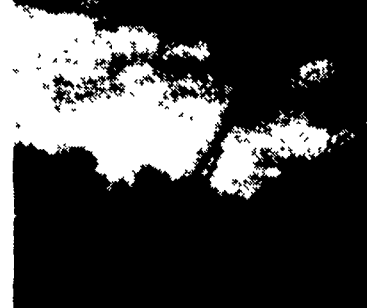
Bucket Trucks 28' to 65' Gas and Diesel. Call For Details.