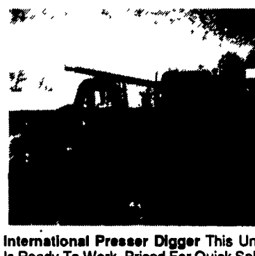
International Presser Digger This Unit Is Ready To Work, Priced For Quick Sale $9,500 $8,500