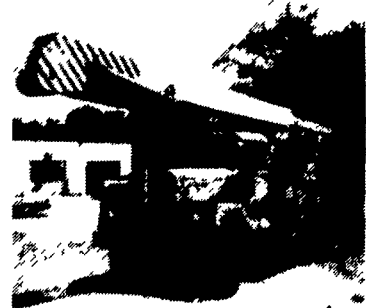
Holan 70' Double Bucket 75' working height mounted on 1981 Western Standard, 6x6 Flatbed, CAT 3208, Auto