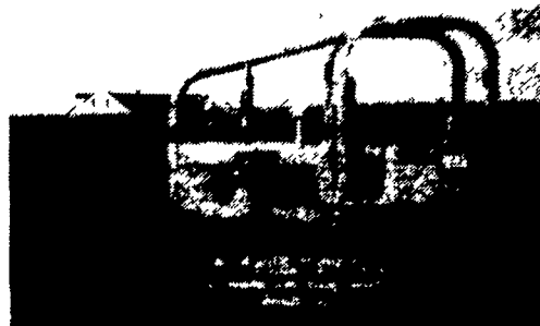
Dresser TD7E, Rebuilt Motor, New Chains, Rebuilt Blade $14,000