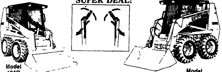
Model 184C 50 Hp Diesel Stop In for a "hands-on" demonstration. Model 1845C 60 hp

BINKLEY & HURST BROS. HAS A UNILOADER FOR YOU! WE ARE YOUR UNILOADER DEALER WITH SERVICE & VOLUME SALES FOR A SUPER DEAL!