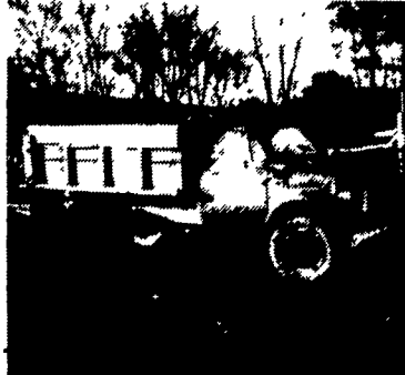
Dump Truck 71 GMC Fleet Maintain with All Service Records, V8, Auto, Insp. & Job Ready.