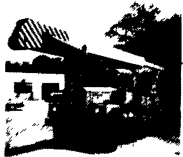
Holan 70' Double Bucket 75' working height mounted on 1981 Western Standard, 6x6 Flatbed, CAT 3208, Auto.