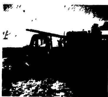
International Presser Digger This Unit Is Ready To Work, Priced For Quick Sale $9,500 $8,500