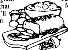
Makes 8 servings.

Combine all ingredients except meat. Add beef and pork and mix well. Shape into a loaf, place in shallow baking pan, and bake at 350° F for 1 1/2 hours.